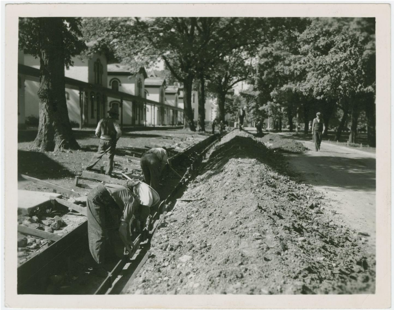
Image: Construction at the Ohio Soldiers' and Sailors' Orphans' Home