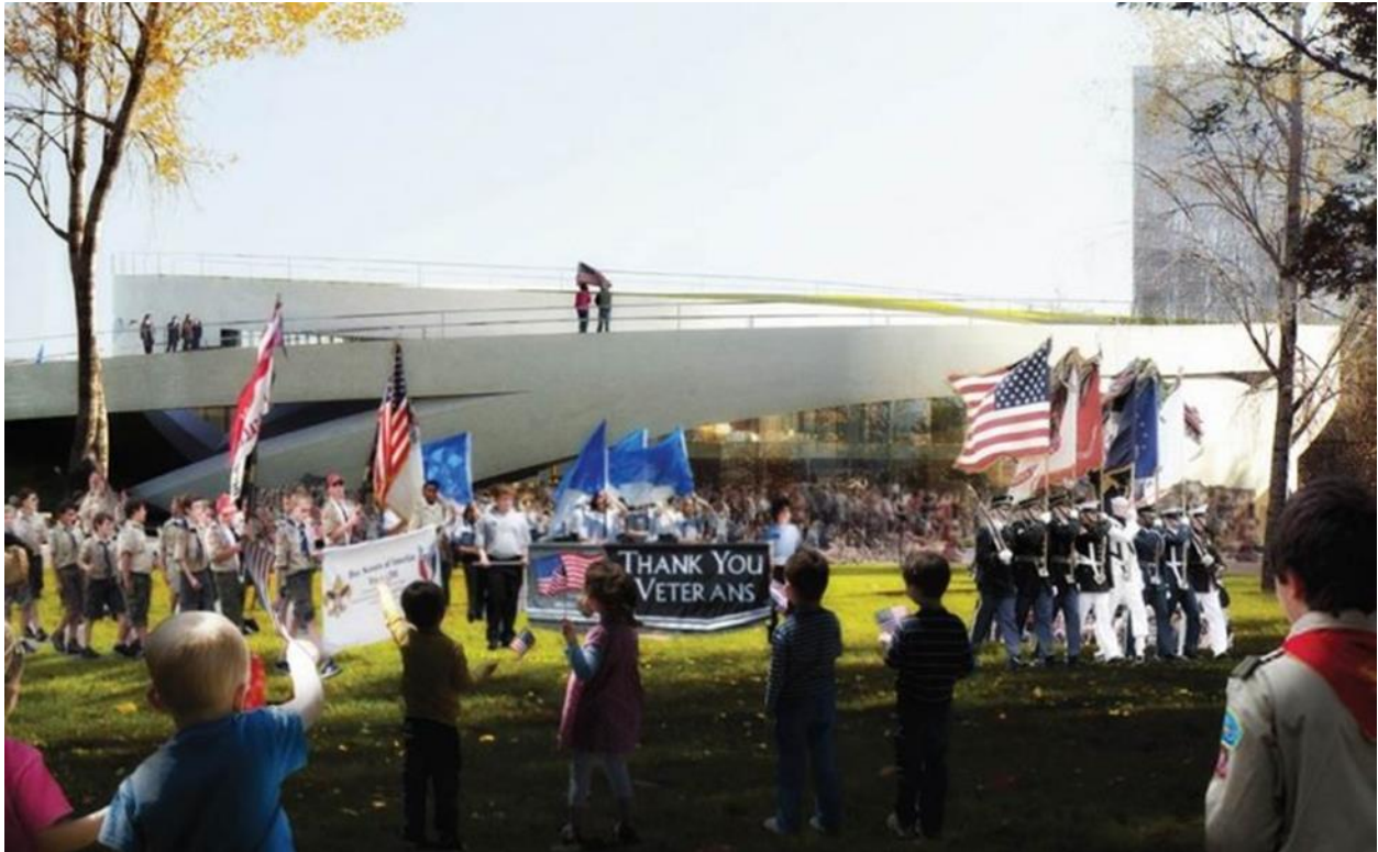
Image: Artist rendering of the National Veterans Memorial and Museum