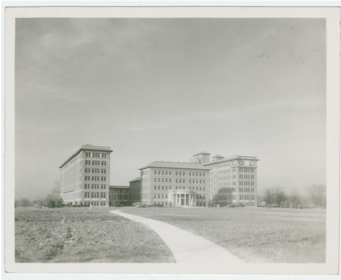
Image: The Brown Hospital on the Soldier's Home campus (Dayton, OH) in 1931.