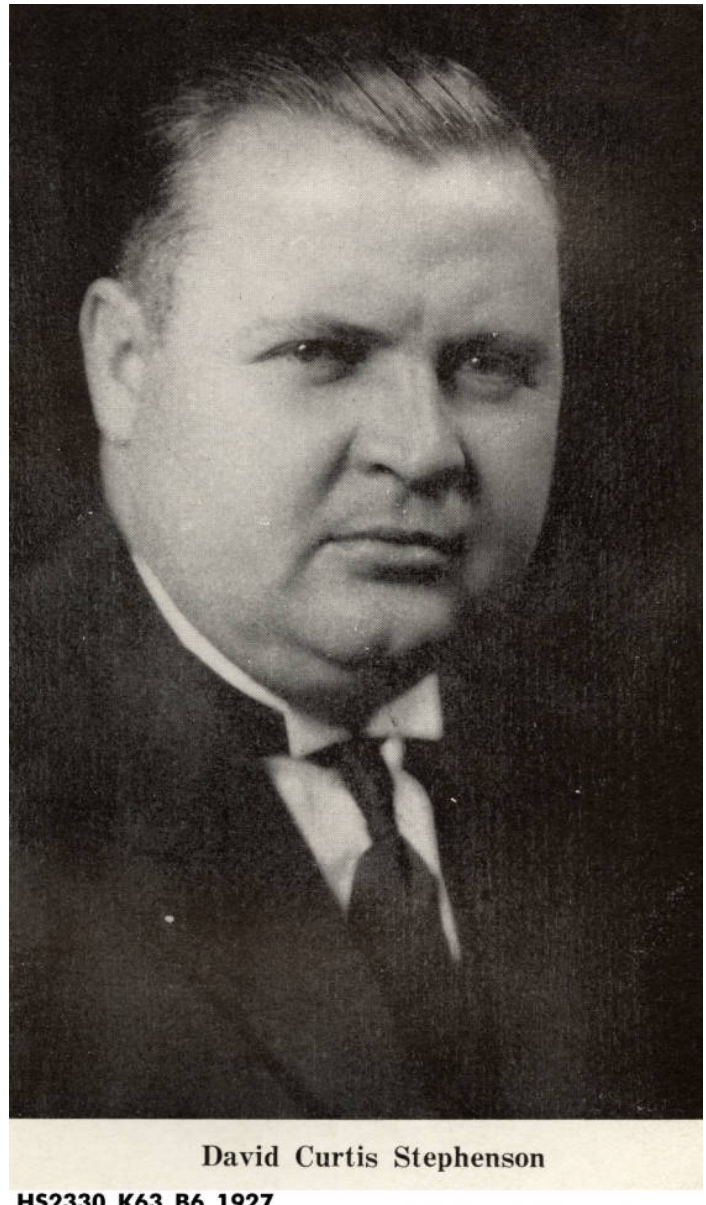
Activity 1: Anticipation Guide: The 1920s Ku Klux Klan in Indiana