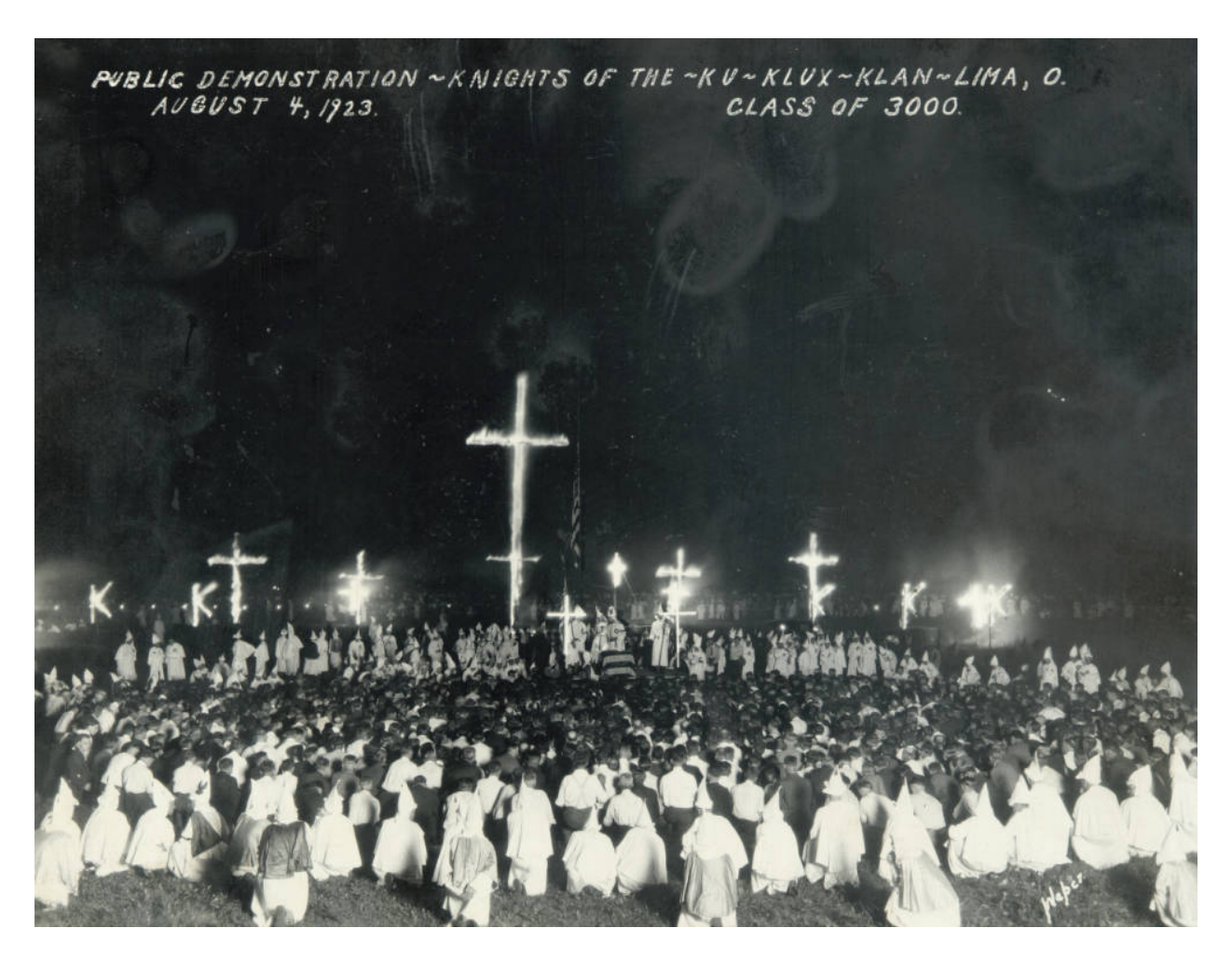
Ku Klux Klan demonstration photograph; Lima, Ohio; August 4, 1923